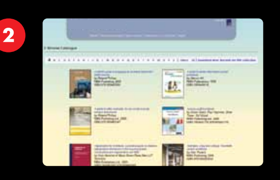
Results can be refined or specific. eBooks can be bookmarked for future reference.

Browse through the catalog for specific eBooks or use the search engine for keywords or phrases.