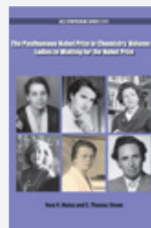
The Posthumous Nobel Prize in Chemistry. Volume 2. Ladies in Waiting for the Nobel Prize