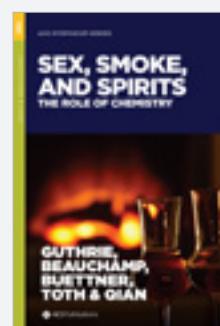
Sex, Smoke, and Spirits: The Role of Chemistry